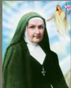
Blessed Celine Borzęcka CR (1833-1913)