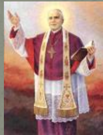
Saint Bishop Joseph Sebastian Pelczar (1842-1924)